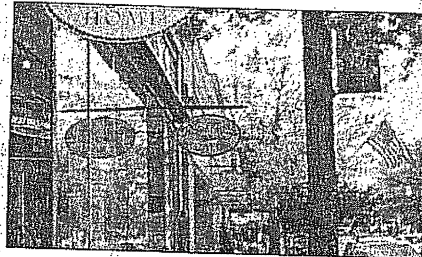
Collingswood has revitalized its downtown area along Haddon Avenue with a variety of businesses.

Officials had no idea Collingswood was in the running until last month, when he received a letter from APA saying Haddon Avenue was being considered for the designation.